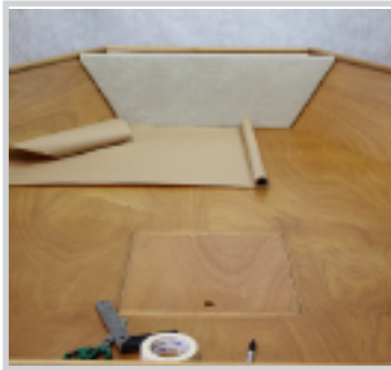
1 - Roll out paper across the Headboard or Bulkhead.