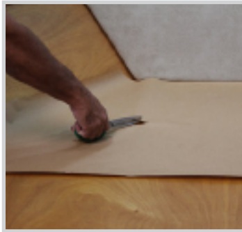
2 - Cut small V-Slits on each side.