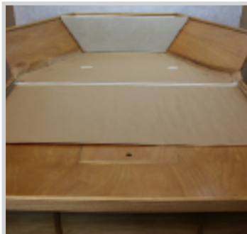
10 - Roll out 2nd layer of paper. Tape down to first layer, crease edges & follow with a pen.