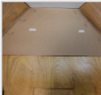
9 - Be sure to measure both sides before the 2nd row of paper. This way you don't have to crawl on top of the pattern, and chance moving it around.