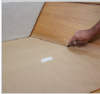
5 - Follow with Pen.