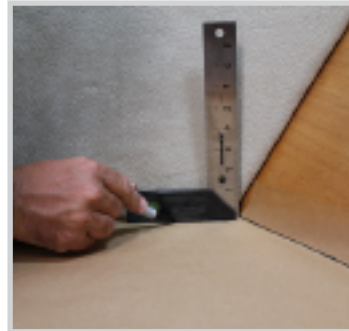
7 - Place the square on the platform where bevel begins. Draw a line at the base of the square so we know which direction you measured.