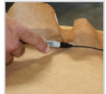
12 - Crease edges into corner radius & finish with a pen.