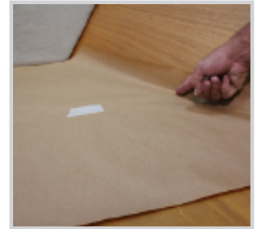
4 - Crease paper with finger.