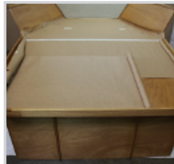
11 - Roll out 3rd layer of paper. Tape down to 2nd.