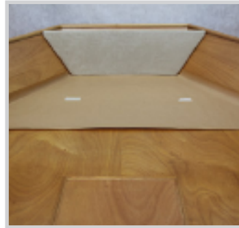
3 - Tape paper down. Be sure to keep edge of paper even with Headboard or Bulkhead.