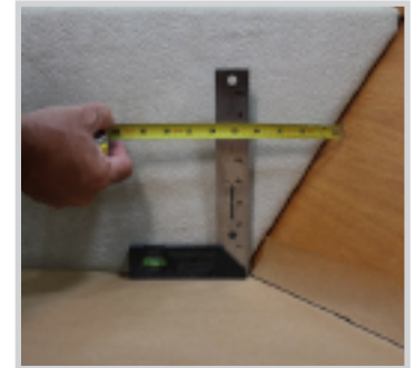
8 - Measure the distance between the square and the hull. Based on the thickness of the mattress you have chosen. Example: If you chose the 6" Latex, go up 6" on the square and measure across to the hull.