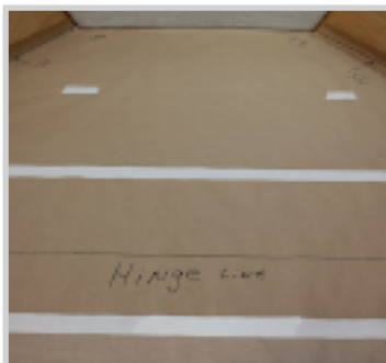
13 - Be sure to mark hinge fold if you want a hinge. Also mark the head location & any other notes needed. If you have a difficult area to explain, attach photos.